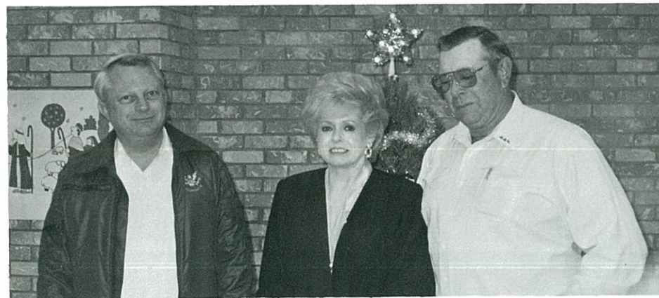
Three of the board members are pictured just before a faculty luncheon. They looked as if they couldn't wait to dig in.